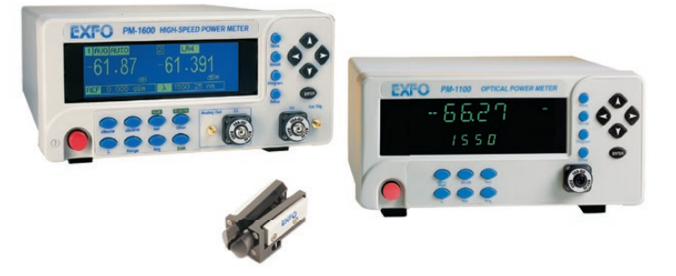
Use the BFA-3000 Universal Bare-Fiber Adapter with the PM-1600W High-Speed Power Meter, and ensure repeatable measurements when testing non-connectorized components.

The PM-1100 and PM-1600 Power Meters offer \pm 0.015 dB linearity with a \pm 5 % absolute uncertainty and a 0.001 dB power resolution. Whether you are measuring absolute or relative power levels, count on efficient, highly accurate measurements.