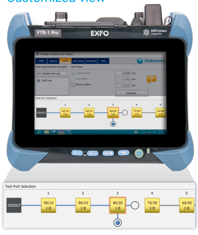
Intuitive test port selection at your fingertips! Configure once and just select your test point.