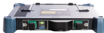
This picture is shown as a guideline only. Actual module may differ depending on the configuration selected.