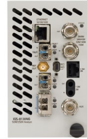
IQS-8130NG with next-generation SONET/SDH/OTN hardware including optical and electrical Ethernet add/drop interfaces