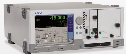
EXFO's IQS-8120/8130 Transport Blazer Test Modules are housed in the IQS-600 Integrated Qualification System, EXFO's powerful lab/manufacturing test platform.

Combined with the built-in IQS Manager software, the IQS-600 platform provides an easy-to-use environment to manage your modules, configure your system, launch applications and analyze results. What's more, it can be controlled using local applications or through GPIB, RS-232 or Ethernet interfaces.