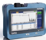
MaxTester 700B OTDR Series