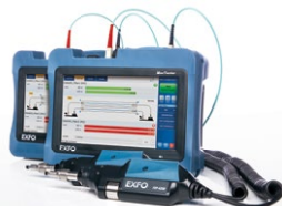
MaxTester 940 Fiber Certifier OLTS