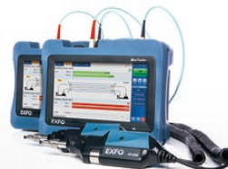
MaxTester 940 Fiber Certifier OLTS