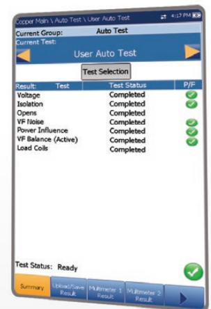
Figure 1. User-friendly interface with clear display of results