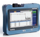
MaxTester 700B OTDR Series