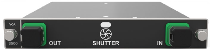
With or without the power monitoring option, the FTBx-3500 module occupies just a single slot.

Featuring integrated power monitoring, the FTBx-3500-BI allows you to precisely control the amount of power your receiver (Rx) under test detects, thereby enabling you to achieve proper BER measurements. The FTBx-3500-CI or FTBx-3500-DI enable similar characterization for multimode applications.