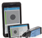
Wireless inspection scope FIP-435B