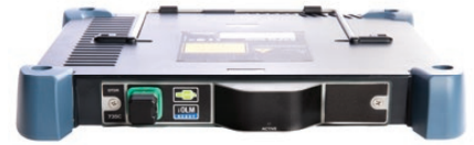
This picture is shown as a guideline only. Actual module may differ depending on the configuration selected.