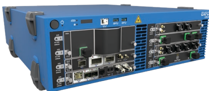
LTB-8 EIGHT-SLOT RACKMOUNT PLATFORM