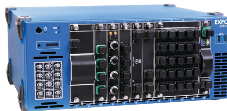
LTB-12 TWELVE-SLOT RACKMOUNT PLATFORM