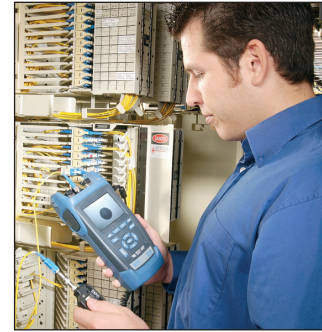
FOT-930 with P5 option

Connect the probe directly to the compact, handheld active matrix LCD screen for safe, efficient inspection. The probe's high-magnification optics project a 530-micron field of view onto the handheld's bright, high-contrast 3.5-inch TFT active matrix LCD display. The handheld display features an Auto-Shutoff interval switch with three settings to ensure long-lasting battery life.