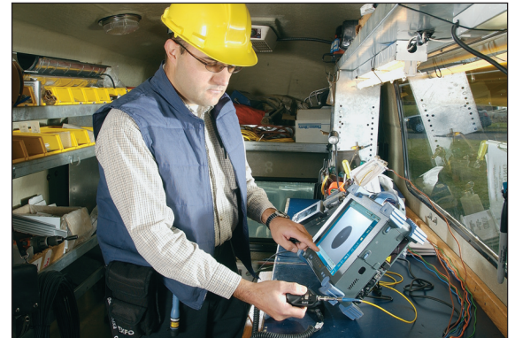
FTB-400 with FIP-USB4

Avoid these problems with the FIP-S/FIP-USB Video Fiber Inspection Probe, a handheld video microscope. Unlike traditional microscopes, the inspection probe facilitates the examination of hard-to-reach connectors on the back of patch panels and bulkhead adapters. It also lets you check the inside of connectors without taking them apart. EXFO offers two ways to achieve clear, sharp images of termination dirt and damage—a convenient handheld display, or our market-leading FTB-400 Universal Test System.