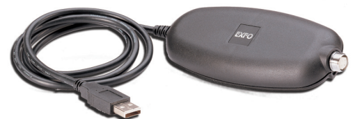
FIP-USB (USB module)