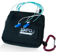
EF launch fiber (SPSB-EF-C30)

Whether for expanding enterprise-class businesses or large-volume data centers, new high-speed data networks built with multimode fibers are running under tighter tolerances than ever before. In the event of failure, intelligent and accurate test tools are needed to quickly find and fix the fault.