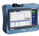
OTDR MaxTester 700B Series