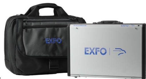
Figure 3. TravelHawk, compact and portable analyzer