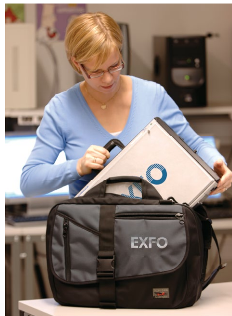
Figure 1. TravelHawk, the only portable protocol analyzer to support 2G, 3G and 4G technologies in one unit

TravelHawk is a briefcase-sized PC equipped with the M5 Analyzer software. It allows real-time troubleshooting of multiple interfaces from LTE, UMTS, GSM, core and IP Multimedia Subsystem (IMS) networks in the lab or in the field. With automated configuration, TravelHawk is quick and easy to set up for analysis. Network traffic analysis is illustrated with clear, real-time graphics, and issues to be addressed are clearly highlighted. New functionalities are easy to install via a software update downloaded directly from the EXFO website. All you need is a valid EXFO Analyzer Care to keep your tool up-to-date.